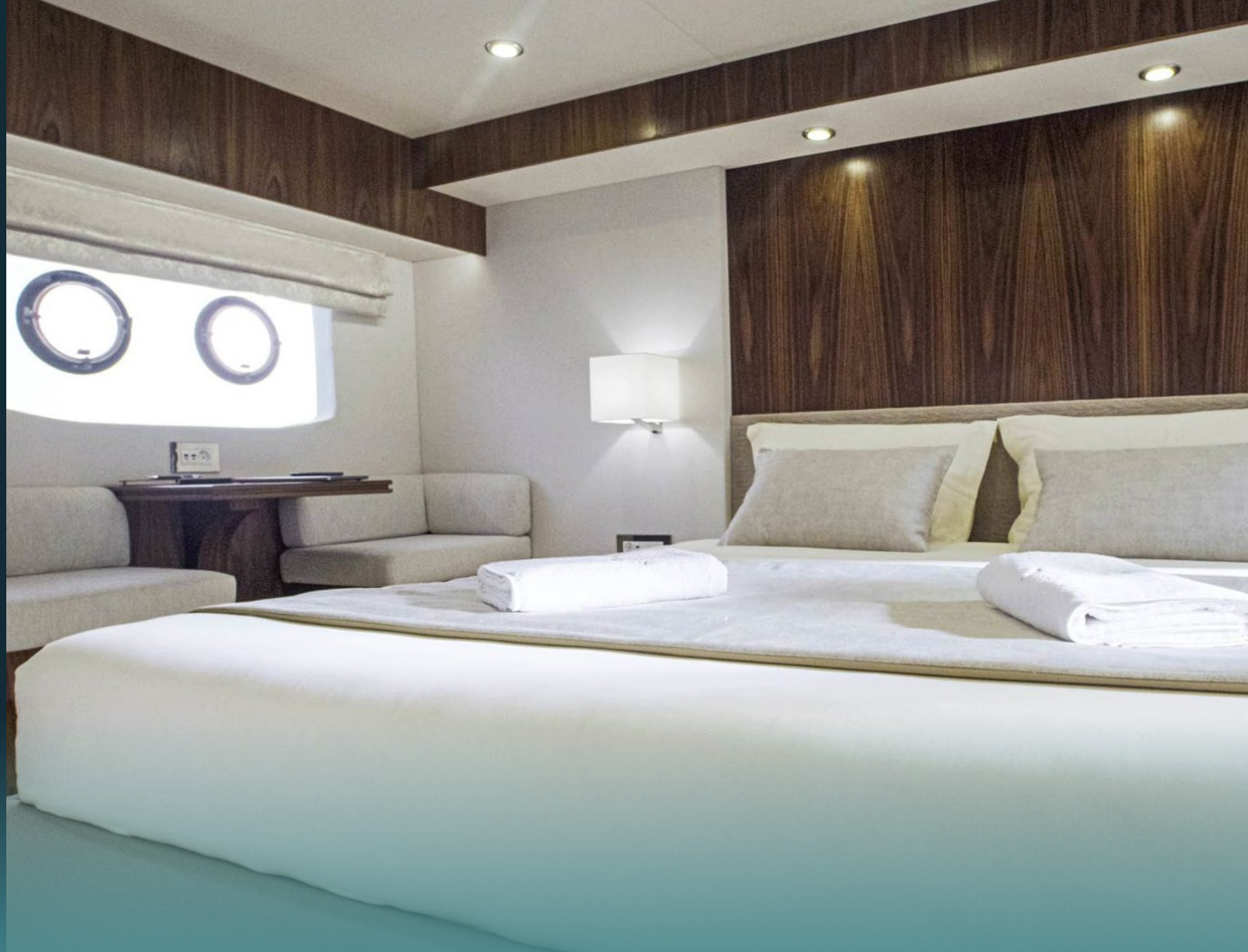
Master cabin view