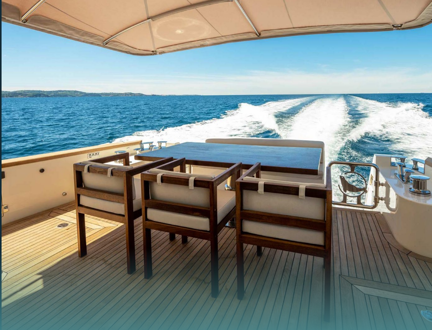
Alfresco table back view