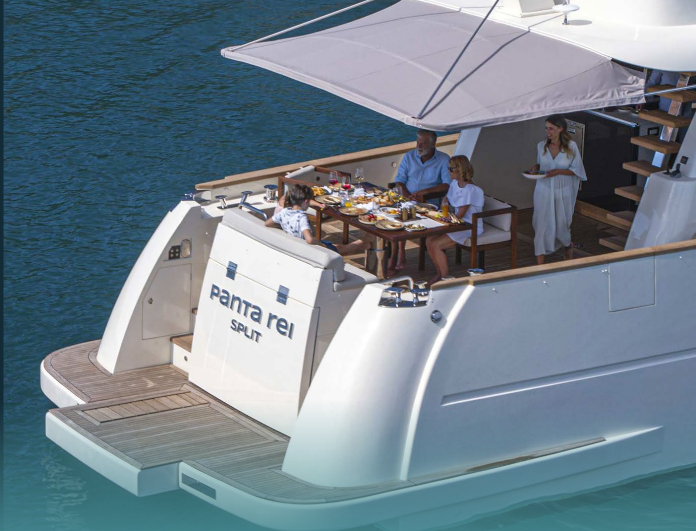
Aft cockpit alfresco