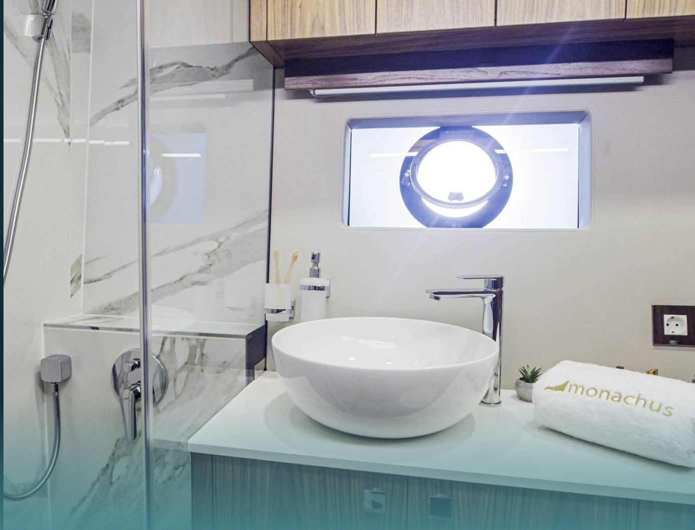
Master cabin bathroom